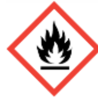
Flammables, Self Reactives, Pyrophorics, Self-Heating, Emits Flammable Gas, Organic Peroxides