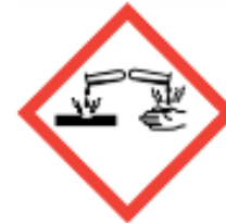
Burns Skin, Damages Eyes, Corrosive to Metals