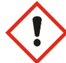
Acutely toxic(harmful), Irritant to skin, eyes or respiratory tract, Skin sensitizer, Hazardous to the Ozone layer.