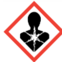
Carcinogen, Respiratory Sensitizer, Reproductive Toxicity, Target Organ Toxicity, Mutagenicity, Aspiration Toxicity