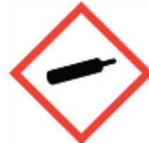
Gases Under Pressure