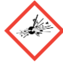
Explosives, Self Reactives, Organic Peroxides