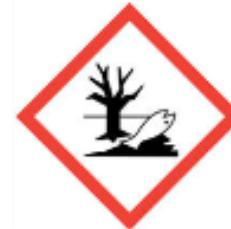
Toxic to aquatic environment