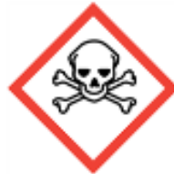
Acutely Toxic (severe)